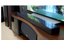
What hi fi best soundbars 2018. Top 5 best soundbars.